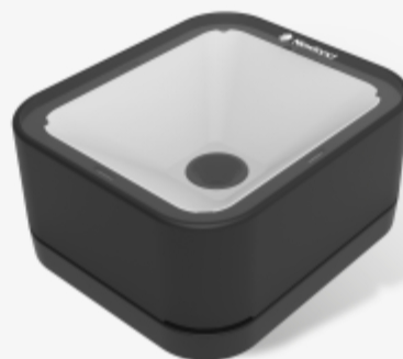
FR27 Urchin stationary scanners